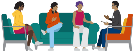
Mental and behavioral health

As part of our commitment to improve health and health equity in our community, every 3 years we conduct a rigorous and collaborative community health needs assessment. For 2023, Kaiser Permanente identified the following significant health priorities in our San Mateo communities.