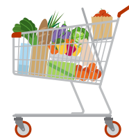
Healthy eating active living