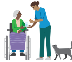
Access to care