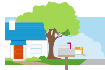
Housing and homelessness