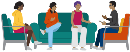
Mental and behavioral health

As part of our commitment to improve health and health equity in our community, every 3 years we conduct a rigorous and collaborative community health needs assessment. For 2023, Kaiser Permanente identified the following significant health priorities in our East Bay communities.