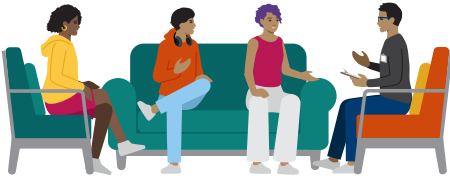
Mental and behavioral health

As part of our commitment to improve health and health equity in our community, every 3 years we conduct a rigorous and collaborative community health needs assessment. For 2023, Kaiser Permanente identified the following significant health priorities in our Diablo communities.