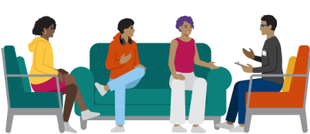
Mental and behavioral health

As part of our commitment to improve health and health equity in our community, every 3 years we conduct a rigorous and collaborative community health needs assessment. For 2023, Kaiser Permanente identified the following significant health priorities in our Central Valley communities.